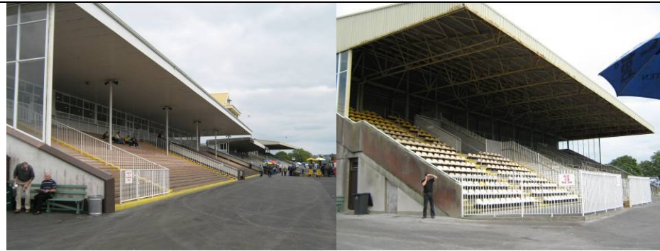
The New Stand Complex