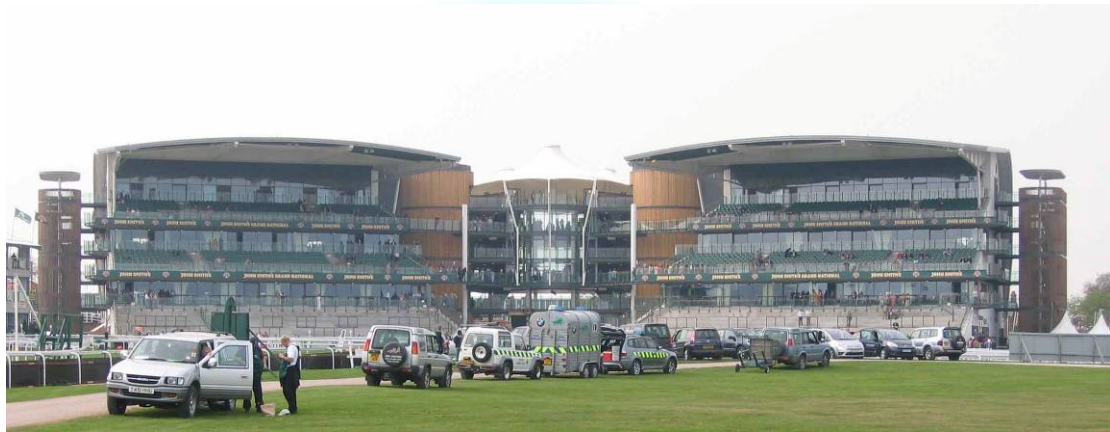
Earl Of Derby and Earl Of Sefton Stands

Having decried the crowds, the atmosphere at National day is something you should experience at least once in your life. OK you will see more on TV at home but what you won't get is the sheer buzz of the place, best exemplified by the roar as the race sets off.