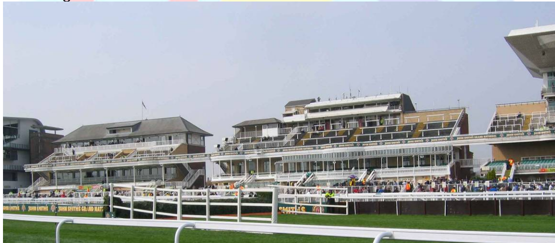
County and Queen Mother Stands

Aintree is a course designed for the big occasion and it has spent a great deal of money investing in new infrastructure. Rather than going for a big bang approach like Ascot, Aintree opted for a phased approach and although it took longer it has meant each phase has been introduced with fewer teething problems. The problem now is that Aintree has some very high class facilities but, arguably, too few meetings to fully take advantage of them.